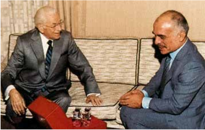
👉 Herbert Armstrong presents a gift to King Hussein, a longtime friend. They first met in Amman in 1971.

minister of information and president of the university. A reception and a large banquet were held in his honor, with television and radio news journalists reporting the events.