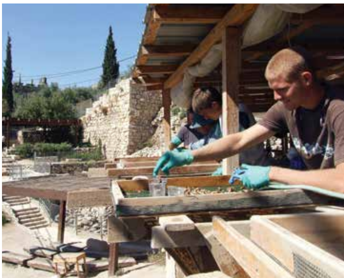
☞ Armstrong College students meticulously rinse stones and artifacts found in the palace of David in 2008.