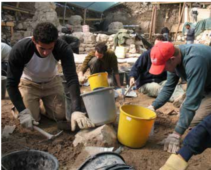
☞ Herbert W. Armstrong College students and other excavation staff members work at the palace of David dig site in 2007.