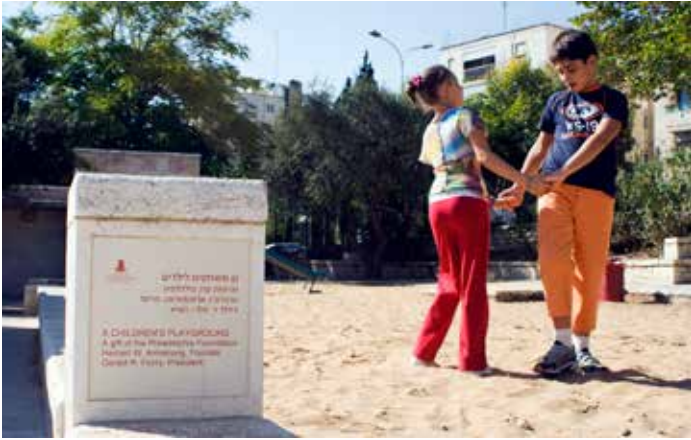
☞ Children play at the Liberty Bell Park playground.