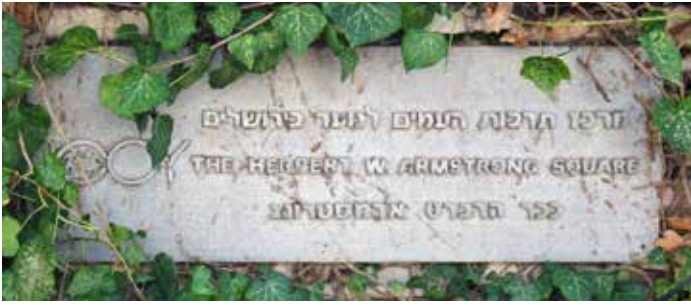
☪ The namesake plaque of the square in front of the ICCY.

he wrote, “During the years of our association with him, all of us developed the highest regard for his wonderful personality and qualities. His deep devotion to the ideals of peace and justice in the spirit of the biblical prophets was appreciated by his friends in Israel. His feeling for Israel and Jerusalem was manifested in his true interest in the archaeological excavations near the Temple Mount and in the City of David. His name will always be attached to this most important undertaking carried out in Jerusalem.”